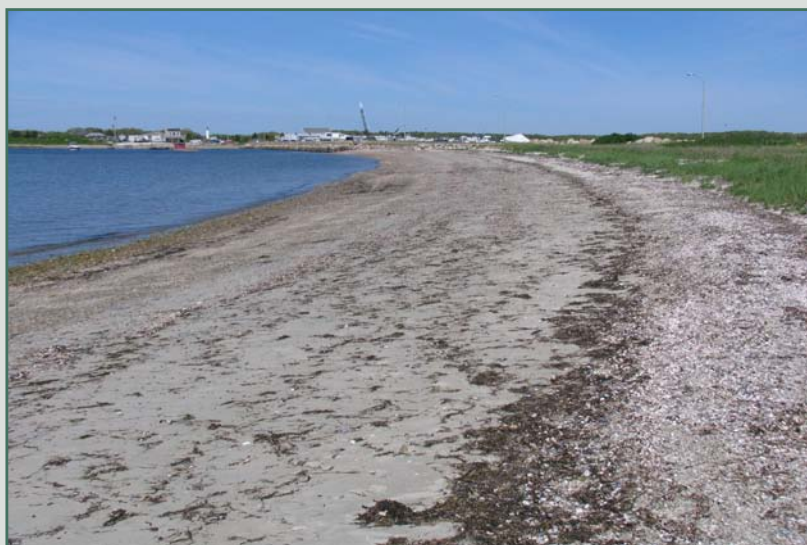
Collection point 5a at low tide on 31 May 2004 looking west.