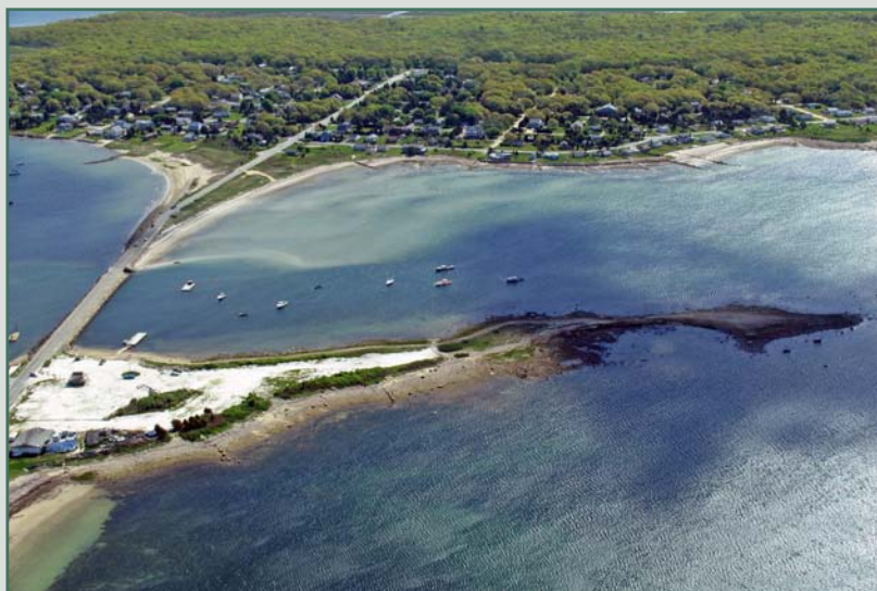
View looking east toward collection points 5a and 5c at low tide on 29 May 2004.