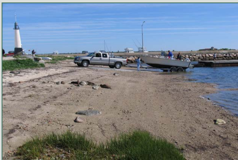
Collection point 5d at low tide on 31 May 2004 looking north.