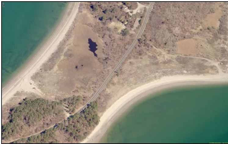
Interior marsh located on Long Island.