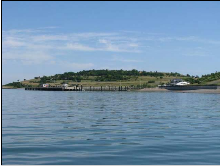
Dock on the Southwestern shore of Spectacle Island