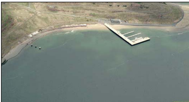
Possible staging area on Spectacle Island