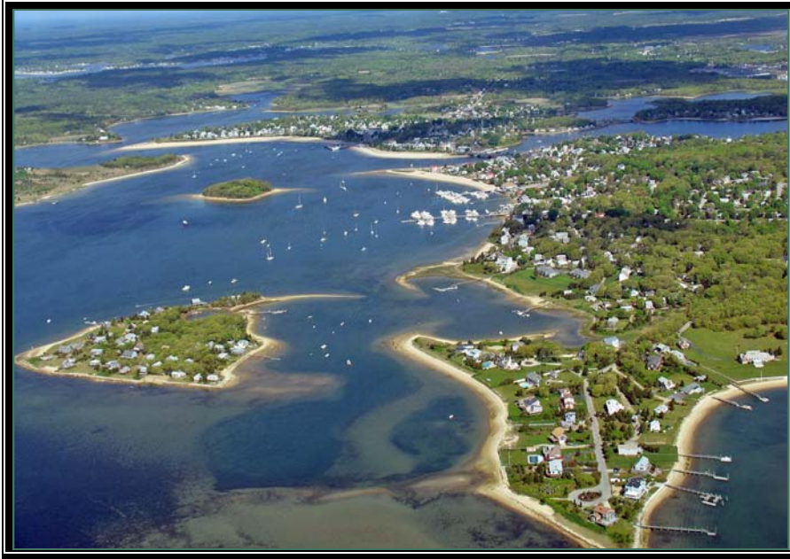
View of entrance to bay looking east at low tide on 29 May 2004.