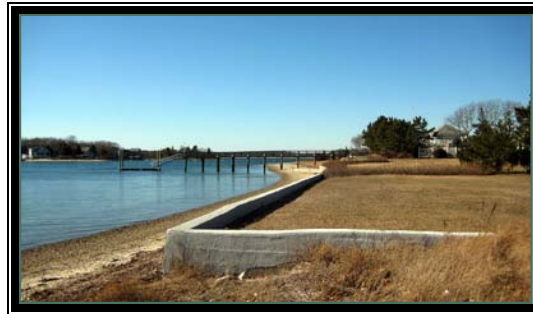
Sias Point at mid-tide on 14 January 2008. View looks west.