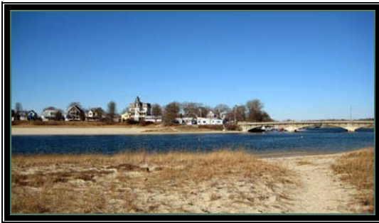
Entrance to East River and Broad Cove at mid-tide on 14 January 2008. View looks northwest.